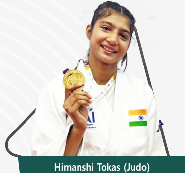
Dushanbe Grand Prix, Tajikistan Selected in Commonwealth Games,