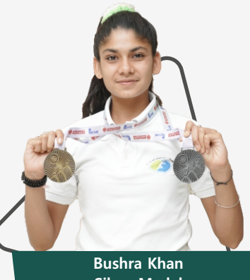
Silver Medal Asian Championship, Korea